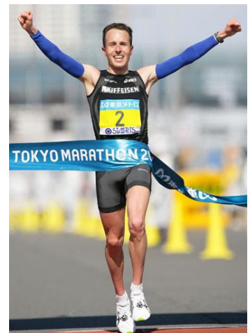
Viktor Röthlin's victory in 2:07:23h

"To win here in Tokyo, in this marathon-crazy country, is absolutely incredible for me," Röthlin said after the race. He beat his own national record, which he established on April 1st last year in Zurich, by exactly 57 seconds. With this performance in Tokyo, Viktor Röthlin has also demonstrated that he is an >